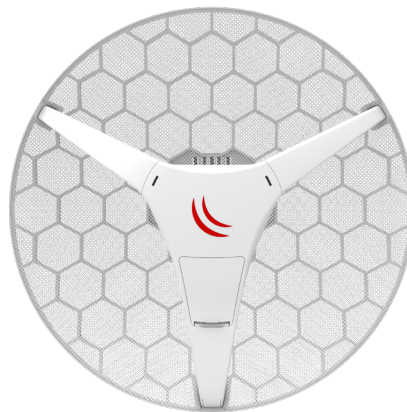
LHG HP5 / LHG 5 ac