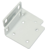
Rackmount bracket white