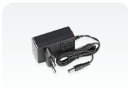
48 V 0.95 A power adapter