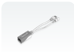
Gigabit PoE injector