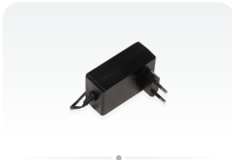
48 V 0.95 A power adapter