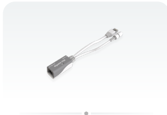
Gigabit PoE injector