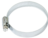
A hose clamp included

The mANT LTE is an omnidirectional antenna specifically designed for LTE frequencies. It is an excellent companion to our LTE devices, such as the wAP LTE and LtAP series. The antenna has a 5 dBi gain, improving your connection in the areas with inadequate LTE service coverage, allowing you to increase your connection speed.