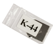
K-44 mount kit