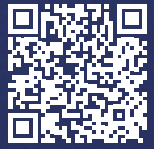
RUT300 360° VIEW