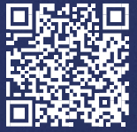
RUT956 360° VIEW