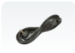
2 Power cords