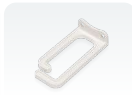
Cable management bracket