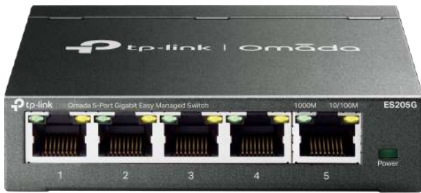
5 × Gigabit RJ45 ports