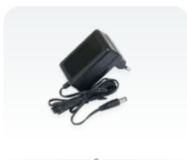
24 V 0.8 A power adapter