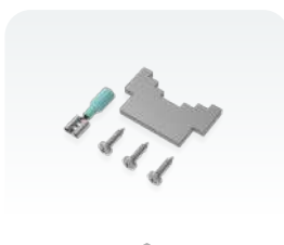
K-LHG fastening set