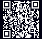
RUTM51 360° VIEW

The RUTM51 is a budget-friendly dual-SIM, multi-network industrial 5G router delivering connectivity for data-heavy applications. With five Gigabit Ethernet ports, dual-band Wi-Fi, and auto-failover, it ensures seamless, reliable performance. Backward compatibility with 4G Cat 12 and a versatile range of interfaces make the RUTM51 5G router a smart, future-proof choice for businesses seeking high-speed connectivity at a lower cost.