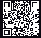
RUTX09 360° VIEW

// RUTX09 is LTE-A Cat 6 cellular IoT router with Dual-SIM, Carrier Aggregation, and 4 Gigabit Ethernet interfaces.